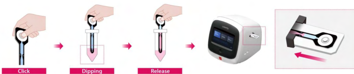
Figure 1. Illustration of the SpectraSlide® AP-1 workflow. Press the sampling button, dip the sampling hole in the sample, release to draw in the liquid, and insert the slide into the LUNA-FX7™ for automated cell counting.

In this application note, we compare the performance of the SpectraSlide® AP-1 against the PhotonSlide™ for viability and concentration analysis of HL60 and Jurkat Cells using the LUNA-FX7™.