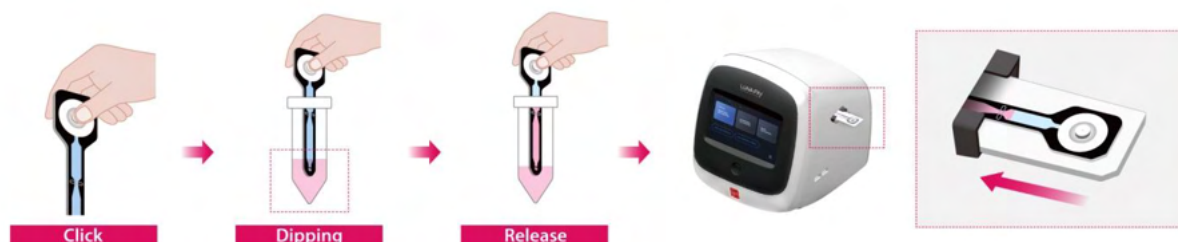
Figure 1. Illustration of the SpectraSlide® AP-1 workflow. Press the sampling button, dip the sampling hole in the sample, release to draw in the liquid, and insert the slide into the LUNA-FX7™ for automated cell counting.

In this application note, we evaluate the performance of the SpectraSlide® AP-1 for viability and concentration analysis of CHO-K1 and HEK293 cells using the LUNA-FX7™, and compare its results to those obtained with the PhotonSlide™.