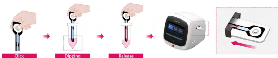
Figure 1. Illustration of the SpectraSlide® AP-1 workflow. Press the sampling button, dip the sampling hole in the sample, release to draw in the liquid, and insert the slide into the LUNA-FX7™ for automated cell counting.

Its pre-coated acridine orange (AO) and propidium iodide (PI) stain solution provides an extended shelf life at room temperature. Upon contact with liquid, the stain dissolves instantly, allowing for immediate and uniform cell staining without any additional mixing. These dyes efficiently penetrate and label nuclei, providing accurate and reproducible viability assessments. Additionally, the slide's user-friendly sampling button facilitates effortless sample loading, making cell counting more consistent and accessible for researchers. By reducing handling steps and ensuring precise viability measurements, the SpectraSlide® AP-1 enhances workflow efficiency while maintaining high accuracy and reliability.