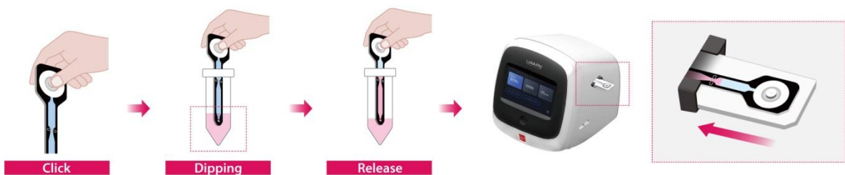
Figure 1. Illustration of the SpectraSlide® AP-1 workflow. Press the sampling button, dip the sampling hole in the sample, release to draw in the liquid, and insert the slide into the LUNA-FX7™ for automated cell counting.

In this application note, we compare the performance of the SpectraSlide® AP-1 against the PhotonSlide™ for viability and concentration analysis of HL60 and Jurkat Cells using the LUNA-FX7™.